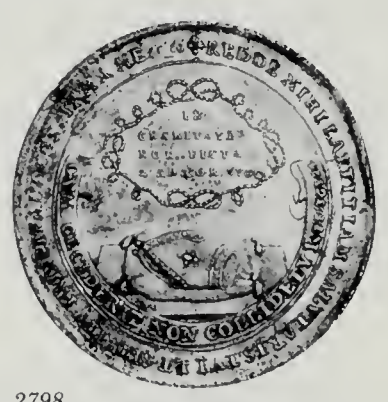
Lot No. 2798